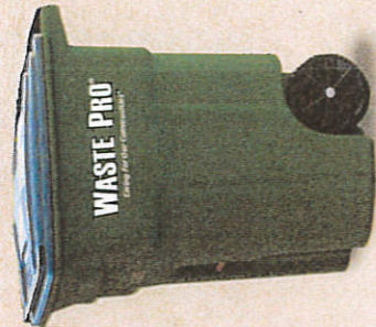
Garbage Roll Cart